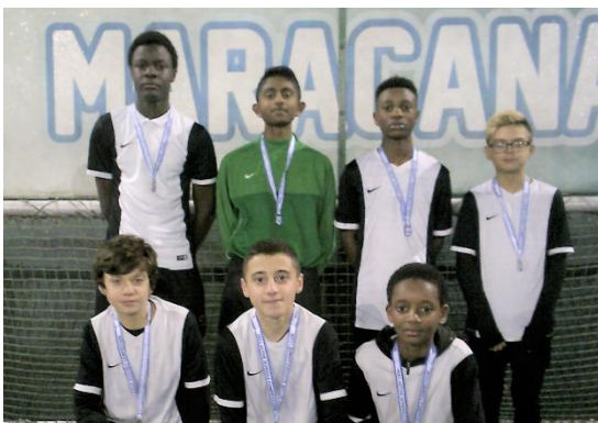
Our Year 9 5-a-side football team at the Hull Schools Tournament in January

This term has seen a fantastic display of sport from all our teams.